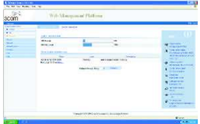
PoE summary information for the Switch 2928 HPWR.