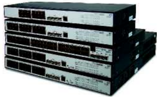
from top to bottom: 3Com Baseline Plus, Switch 2920, Switch 2928, Switch 2952, Switch 2928 PWR, Switch 2928 HPWR

Baseline Plus Switch 2900 models are available with 20, 28, and 52 ports; two 28 port PoE models (one with 170W budget and the other with 365W power budget)