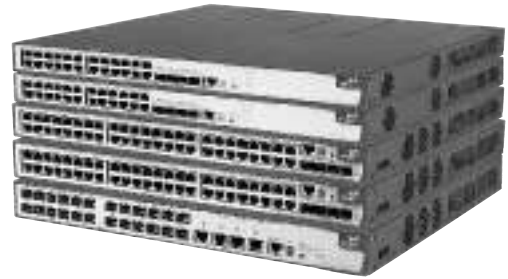
from top: 3Com Switch 5500G-EI 24-Port, Switch 5500G-EI PWR 24-Port, Switch 5500G-EI 48-Port, Switch 5500G-EI PWR 48-Port, Switch 5500G-EI 24-Port SFP

3Com Switch 5500G 10/100/1000 devices provide switching capacity of up to 232 Gbps for 48-port models and 184 Gbps for 24-port models. Wirespeed line-rate performance is delivered on all ports within the stack. Advanced Layer 3 routing—including OSPF, PIM-SM, PIM-DM and RIP v1/v2—helps deliver optimal performance and system response.