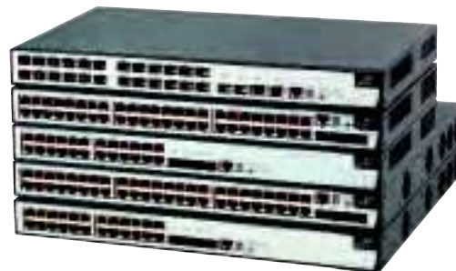
from top: 3Com Switch 5500-EI 28-Port FX, Switch 5500-EI 52-Port, Switch 5500-EI 28-Port, Switch 5500-EI PWR 52-Port, Switch 5500-EI PWR 28-Port

3Com Switch 5500 10/100 devices provide switching capacity of up to 17.6 Gbps for 52-port models and 12.8 Gbps for 28-port models. Wirespeed and line-rate