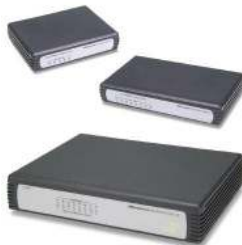
top to bottom: OfficeConnect Fast Ethernet Switch 5, Switch 8 and Switch 16

10/100 Mbps switches for small and medium businesses needing basic connectivity